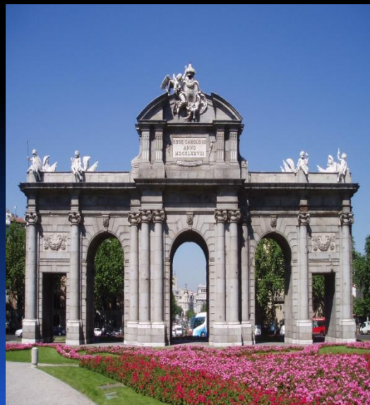
Puerta de Alcalá